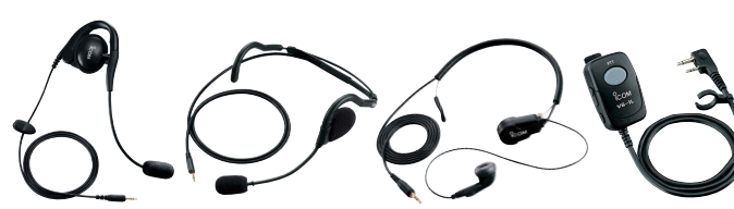
▲ HS-94 ▲ HS-95 ▲ HS-97 ▲ VS-1L

HS-94 : Earhook headset with flexible boom microphone.