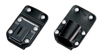
▲ MB-96N ▲ MB-96F

MB-96N : Swivel type belt hanger. Swivel joint of the MB-93 included.