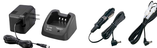
▲ BC-145 ▲ BC-160 ▲ CP-17L ▲ OPC-515L

BC-160 DESKTOP CHARGER + BC-145 AC ADAPTER Charges the BP-231 in 2 hours (approx.).