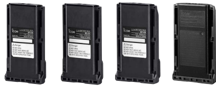
▲ BP-230 ▲ BP-231 ▲ BP-232 ▲ BP-240