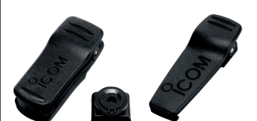
▲ MB-93 ▲ MB-94

MB-93 : Swivel type. A fast and easy way to remove the transceiver from your belt.