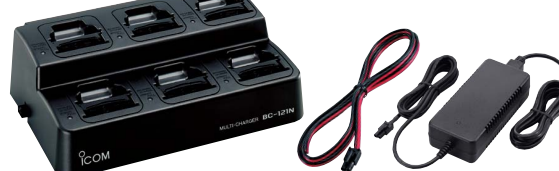
▲ BC-121N+AD-106 (6 pcs.) ▲ OPC-656 ▲ BC-157

BC-121N MULTI-CHARGER + AD-106 CHARGER ADAPTER + BC-157 AC ADAPTER (Six AD-106s are required)